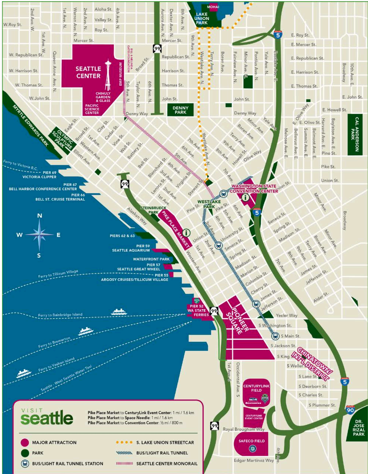
Downtown Seattle and some of the surrounding areas and attractions